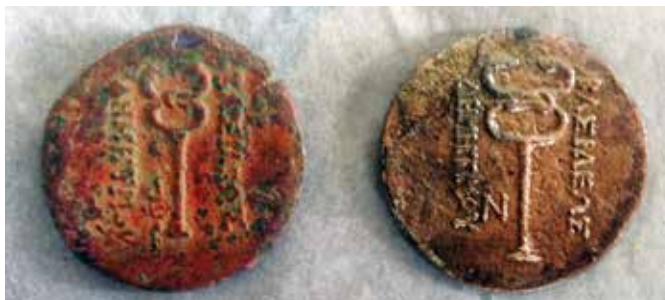
Figure 5. Greco-Bactrian coins. Despite massive looting, more than 11,550 coins have survived in the National Museum's collections