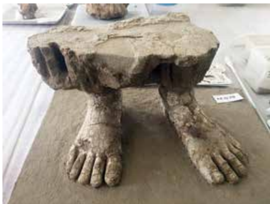
Figure 1. Unbaked clay sculpture from the rescue excavations at the Early Buddhist (second–eighth centuries CE) city of Mes Aynak in the National Museum of Afghanistan Conservation Laboratory