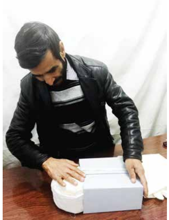
Figure 10. NMA staff re-housing textiles in acid-free packing in the ethnography storeroom of the National Museum