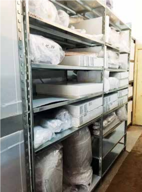
Figure 9. New steel shelving in the storerooms of the National Museum