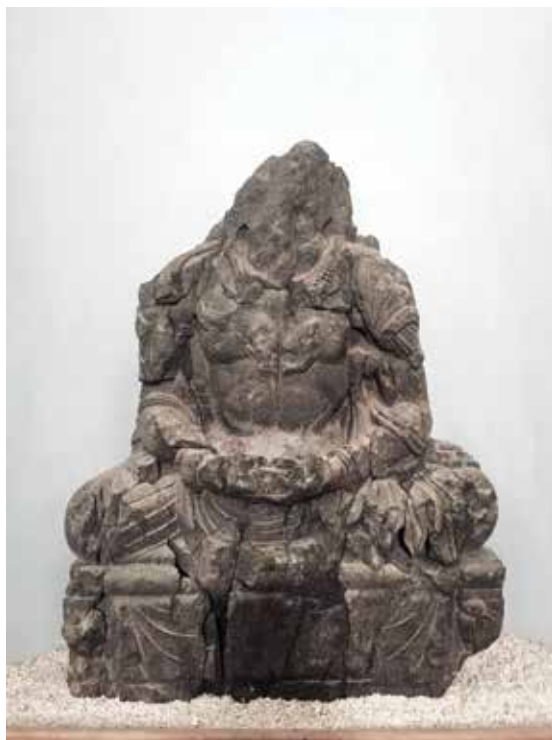
Figure 4. Early Buddhist Gandharan style schist sculpture smashed by the Taliban and later restored

After four years, we estimate that our inventory is about 97 percent complete. We have now inventoried 114,996 pieces in 42,563 object records. The inventory database also includes 117,992 images of scanned archival records and 100,054 object photographs. What we have found so far is in some ways comforting — more than twice as many objects have survived than we had dared to hope. It is heartening that despite the theft of massive numbers of coins from the numismatic collection (including the Museum's holdings from the famous Mir Zakeh hoard, originally weighing about four tons and consisting of an estimated 550,000 Greco-Bactrian and other coins and small objects — the world's largest known coin hoard), nevertheless, at least 11,150 coins from the NMA collections have survived to be described, photographed, and inventoried in our database (fig. 5). Our recording of the NMA's coins is now nearly complete.